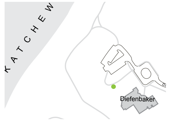
Figure 3. The location of Diefenbaker's grave site is indicated in green on this portion of a contemporary campus map.

The gravesite sits overlooking the river and the city, and is publicly accessible. The openness and accessibility of the site are character-defining elements (Figures 4 & 5).