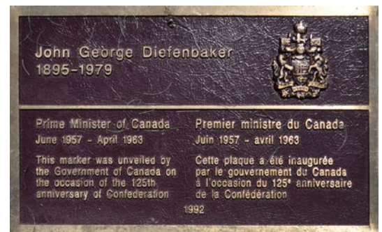
Figure 11. Grave site plaque.