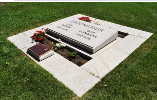
Figure 2. Form and style of the grave stone.