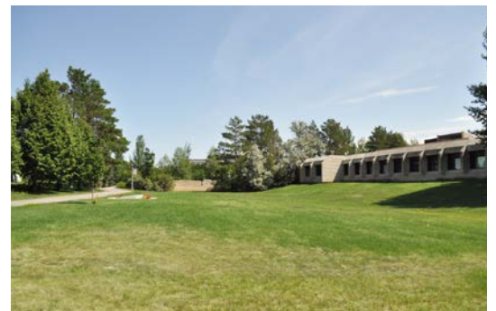
Figure 4. Context of the grave site.