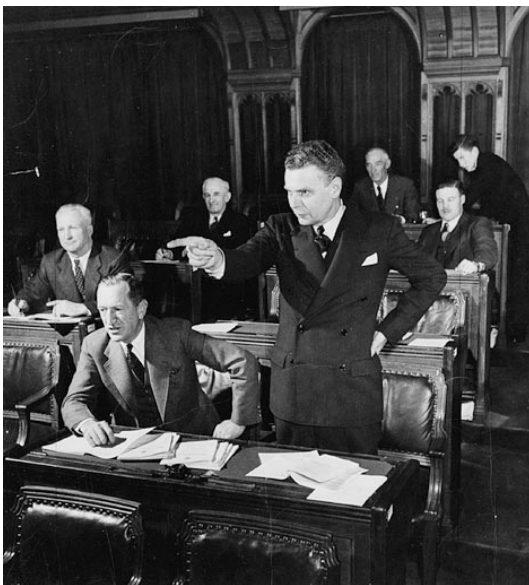
Figure 9. Diefenbaker in the House of Commons.