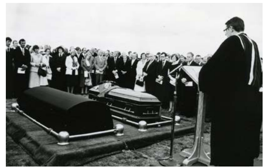
Figure 10. State funeral for John G. Diefenbaker.

A memorial plaque was unveiled in 2000 (Figure 12). The plaque reads: "Right Honorable John George Diefenbaker (1895-1979). John Diefenbaker, a prairie populist and spellbinding speaker, advocated that all Canadians should be "unhyphenated Canadians." He served as prime minister from 1957 to 1963. In 1958, he won the greatest electoral victory in the history of Canada's House of Commons."