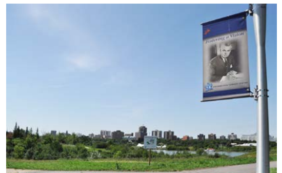
Figure 5. View from Diefenbaker's grave.