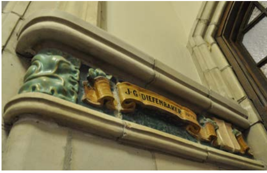
Figure 7. Diefenbaker's name in the MacKinnon Building.