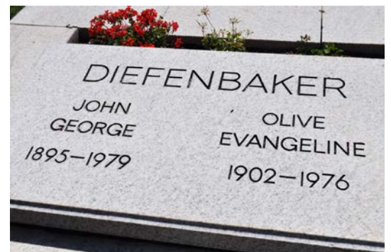
Figure 6. Grave stone.