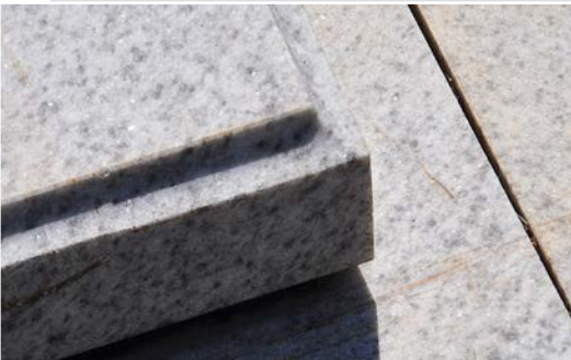
Figure 1. Granite grave stone.

The gravesite has heritage value due to its cultural and chronological associations with John Diefenbaker and with the history of his time in office. Diefenbaker is remembered for his legacy of advancing civil rights and for his vision of 'One Canada,' as well as for the controversy surrounding the cancellation of the Avro Arrow project. Diefenbaker died in August 1979 and was buried with his wife, Olive whose remains were moved from Ottawa to Saskatoon at his request. The location of Diefenbaker's grave at the University of Saskatchewan serves to commemorate his place in Canadian history, and his long association with the University of Saskatchewan and the Province of Saskatchewan.