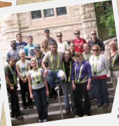
Summer Grounds Crew - What a summer it was!