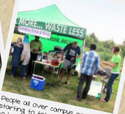
People all over campus are starting to take sustainability to heart.