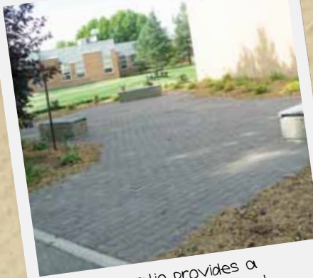
The FMD patio provides a place for staff to sit and enjoy their coffee or lunch.